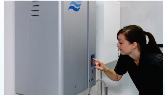
The Nortec GS gas-powered steam humidification system is the industry's first fully condensing and efficiency-leading.

Regardless of which system you consider, load size required, or what energy supply is available, we have the ideal solution. Our electric, gas and steam-to-steam humidifiers are simple to use, simple to maintain and are reliable products. Tried and trusted for more than 40 years, they are designed to be efficient and benefit any interior environment.