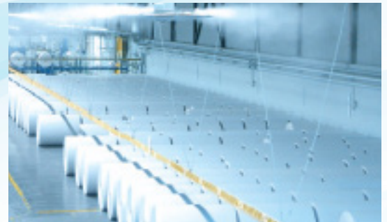
Direct room humidification solutions enhance productivity, improve quality during storage and enable conservation of value of cultural assets, or the reduction of absenteeism rates due to a cold or the flu.