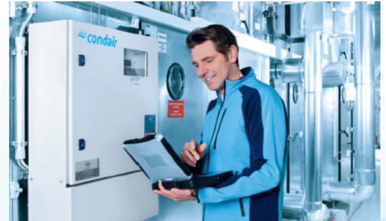
Condair Dual in an air handling unit (AHU). To achieve an optimal indoor climate, air humidification is an indispensable part of an overall ventilation and air-conditioning.

Adiabatic humidification is ideal for a large range of operating environments such as paint workshops that require spray-on layers to adhere consistently, server rooms sensitive to static discharge associated with low relative humidity, offices in need of properly humidified air to reduce absenteeism stemming from health issues and even condominium developments looking to efficiently maintain a healthy environment for their residents.