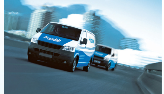
Conair is the leading manufacturer of commercial and industrial humidification.

In this humidification product guide, you'll learn what technologies we offer, how they work, the benefits associated with introducing our humidifiers to your facility and which of our high-performance and low-maintenance products is suited to your application.