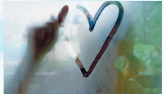
We love humidity for every application.